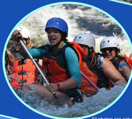
All photos are actual Troop 99G photos. No stock images here!